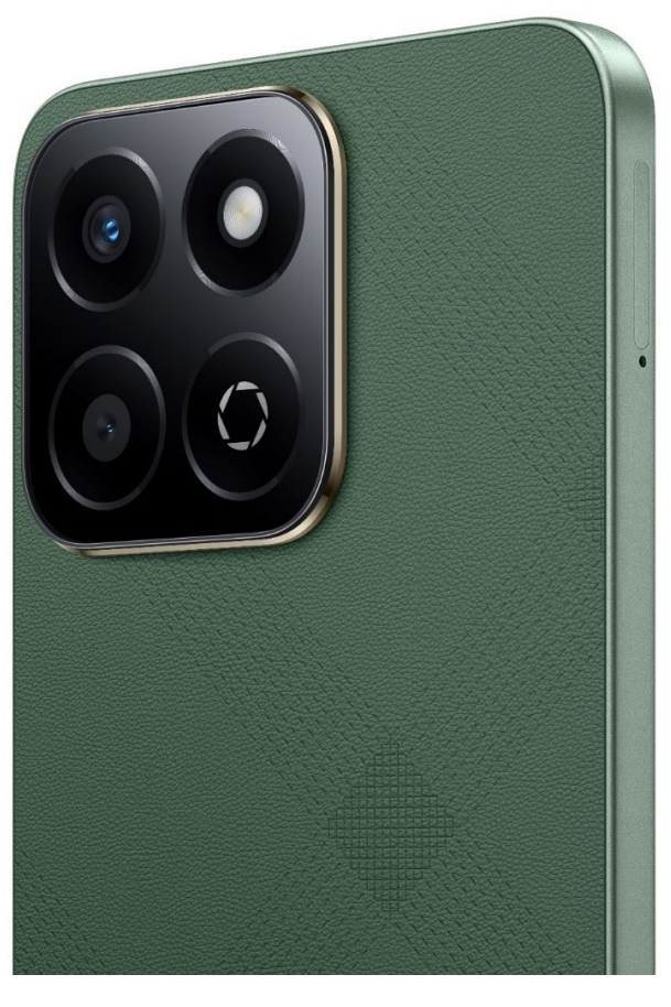
HONOR Product Environmental Report

In addition, the device including the recommended charger meets energy efficiency requirements of EU ErP Directive (EU) 2019/1782 and Commission Regulation (EU) 2023/826.