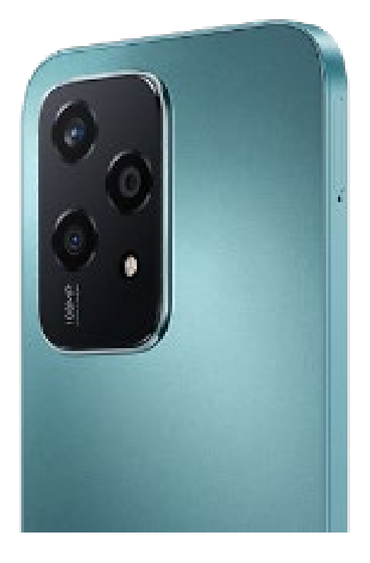
HONOR Product Environmental Report

In addition, the device including the recommended charger meets energy efficiency requirements of EU ErP Directive (EU) 2019/1782 and Commission Regulation (EC) No. 1275/2008 and (EU) 801/2013.